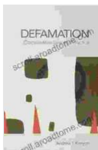
Image Alt Attribute: Justice and Defamation: Navigating the Labyrinth

Embark on a journey through the intricate tapestry of defamation law with "Defamation: Comparative Law and Practice." Discover the nuances of this multifaceted legal concept, gain invaluable insights from a comparative perspective, and equip yourself with the tools to navigate defamation cases effectively. Let this authoritative text guide you through the complexities of reputation management and the pursuit of justice in the digital age.