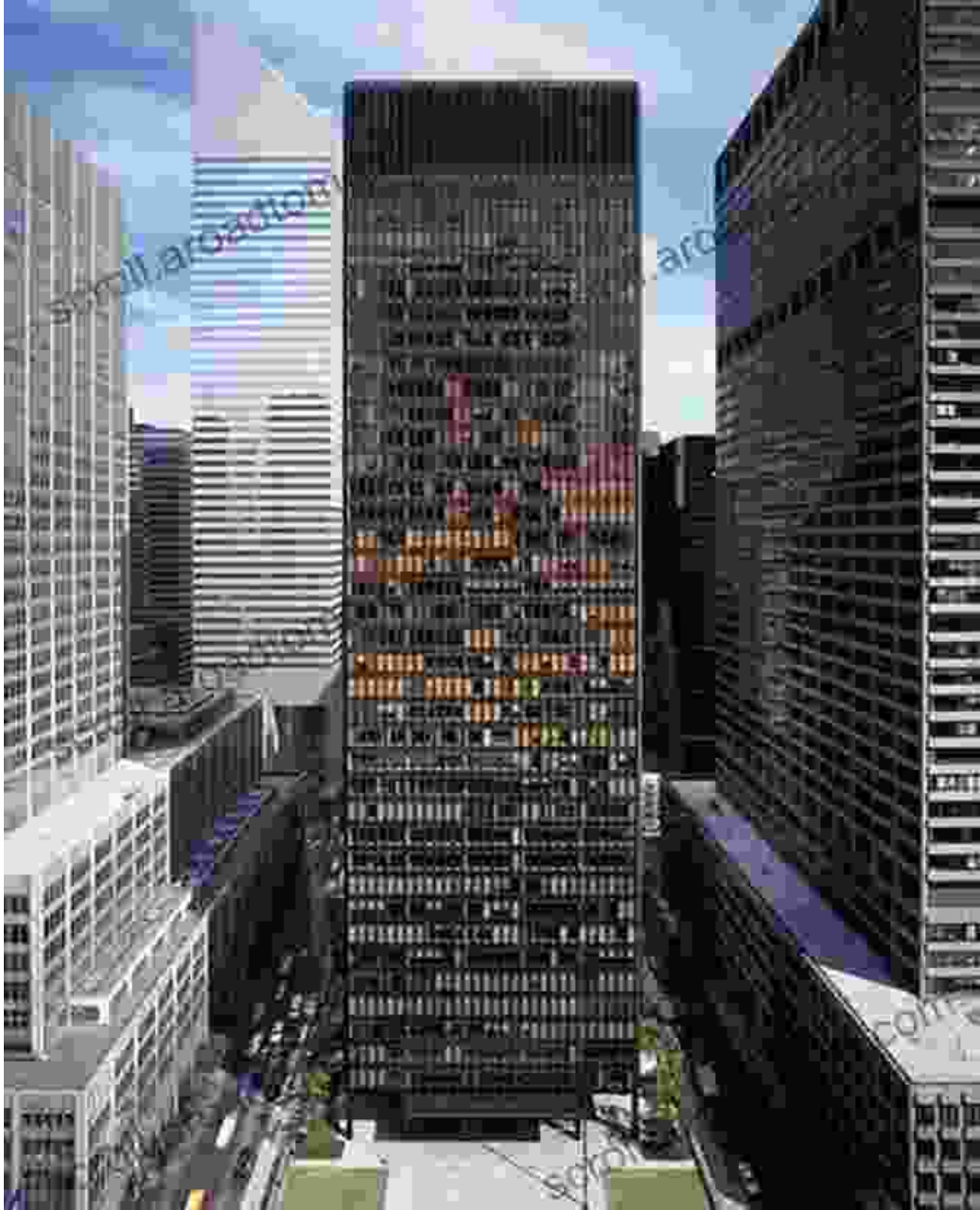
The Seagram Building, a collaboration between Mies van der Rohe and Philip Johnson, is a classic example of International Style architecture.