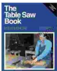
Table Saw Book, The: Completely Revised and Updated (A Fine Woodworking Book) by Kelly Mehler

Now, with the latest edition, the "Completely Revised and Updated Fine Woodworking Book" takes this woodworking bible to new heights. This comprehensive guide has been meticulously overhauled from cover to cover, offering an unparalleled source of information for both aspiring and experienced woodworkers.