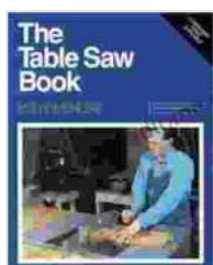
Table Saw Book, The: Completely Revised and Updated (A Fine Woodworking Book) by Kelly Mehler

Invest in the "Completely Revised and Updated Fine Woodworking Book" today and elevate your craft to new heights.